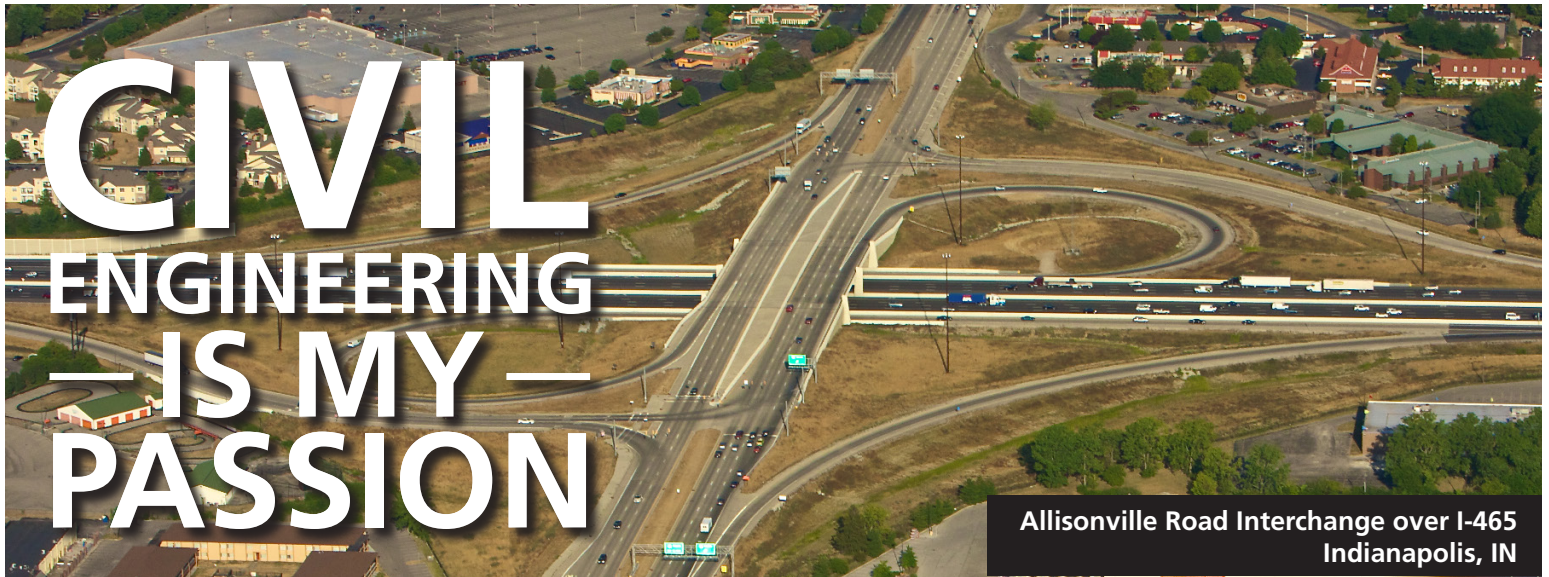
Allisonville Road Interchange over I-465 Indianapolis, IN

At CHA , Civil Engineers work within many different areas including: