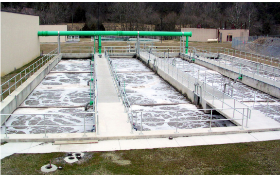
WWTF Upgrade/Expansion to 6.0 MGD Christiansburg, VA