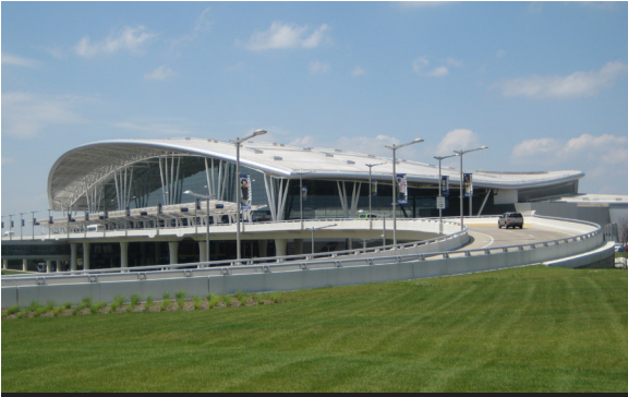
Indianapolis International Airport New Midfield Terminal | Indianapolis, IN