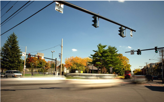
City of Albany Delaware Avenue Reconstruction | Albany, NY